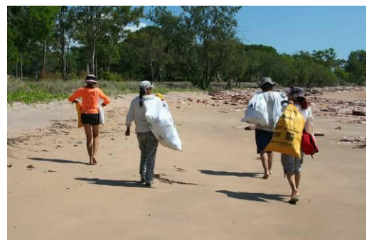
Above: Collection of rubbish from shore