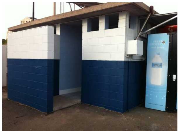
Gone are the days of the beige block with a new blue and white design being implemented