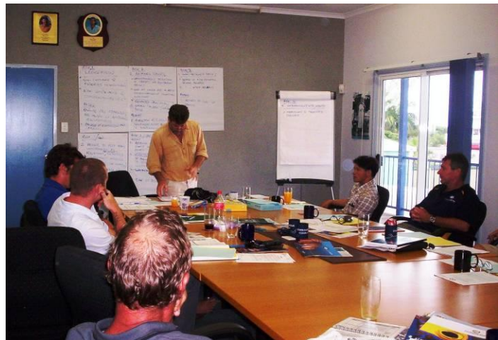
Aquarium Fishery EMS workshop

The first two fisheries involved in the project are the Aquarium Fishery and the Mud Crab Fishery. As an initial first step workshops are being held with interested industry members to undertake a risk assessment of each fishery and provide ideas for practical actions to reduce the risks.