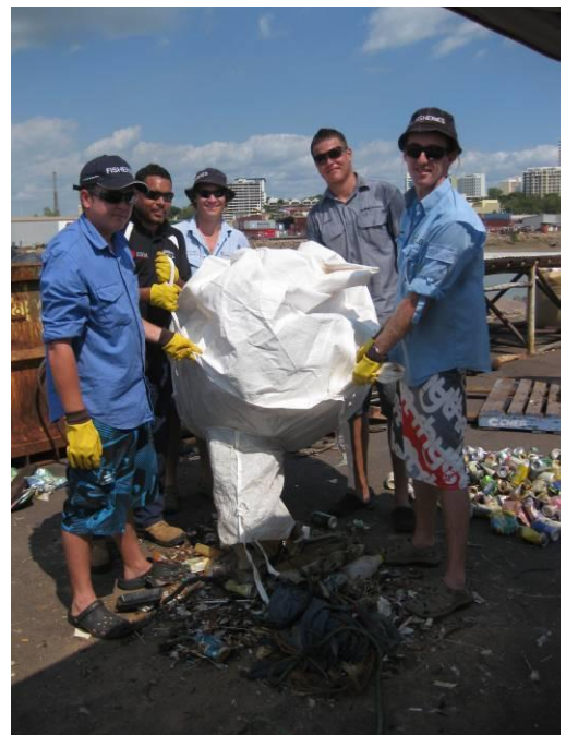
Above: Fisheries and Rangers sorting the rubbish at Fishermen's Wharf