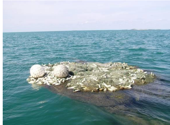
Ghost nets pose a dangerous hazard to marine life