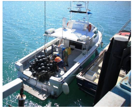
Above: Water Police recover lost buoys as part of marine collection