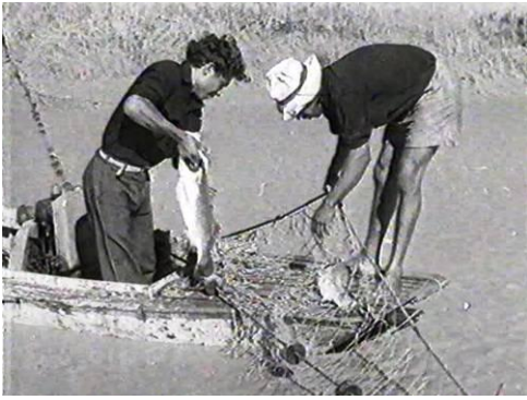
Historical information on the fishery was included in the EMS

The Northern Territory Barramundi Fishery started its commercial fishing season with a difference on the 1 st February as commercial fishers headed to sea equipped with a revised Environmental Management System (EMS).