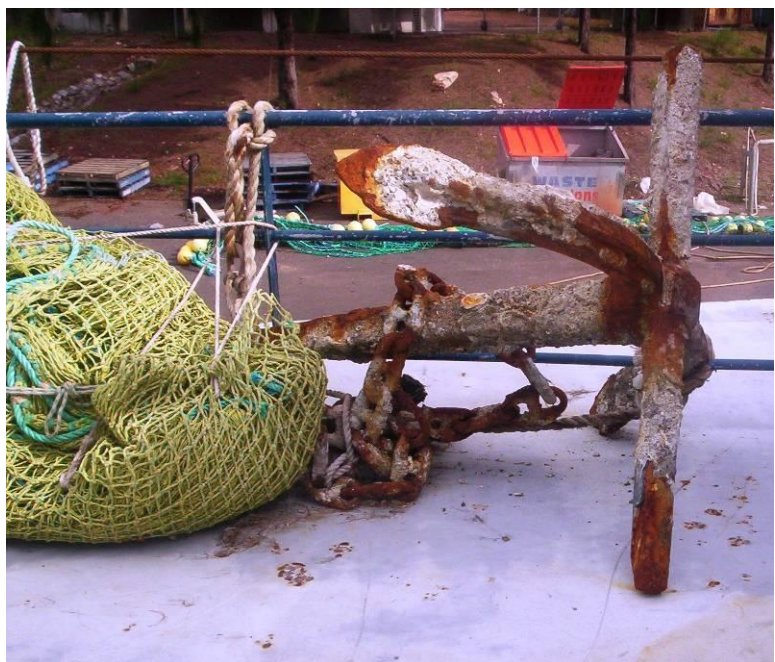
Lost foreign fishing gear, an anchor and the net it damaged on FV Territory Leader

There is some concern from industry about the use of the term “ghost net” with fears the public could mistakenly link the term with the local fishing industry, especially those sectors using nets.