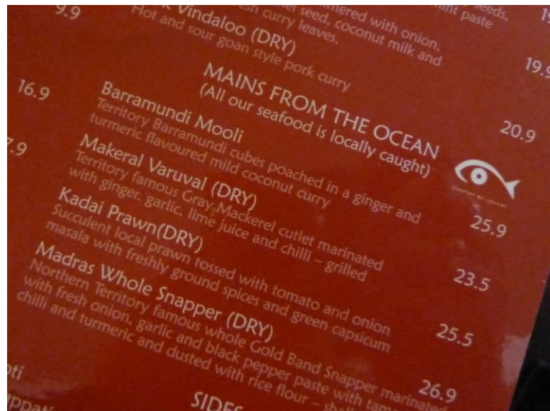
Saffron restaurant is tapping into consumers needs by labelling local seafood on their menu

On average over the four waves of surveying, 39% of consumers assume seafood is from overseas unless told otherwise. The majority of the consumers state Country of Origin is very important to them and that they will pay more for local seafood.